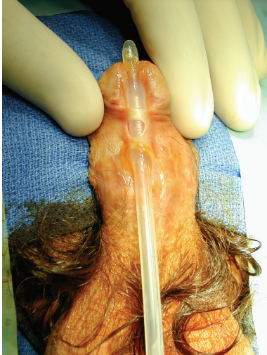
FIGURE 1: Typical complex urethral stricture after childhood hypospadias repair, with a distal penile location and complicating fistulae.