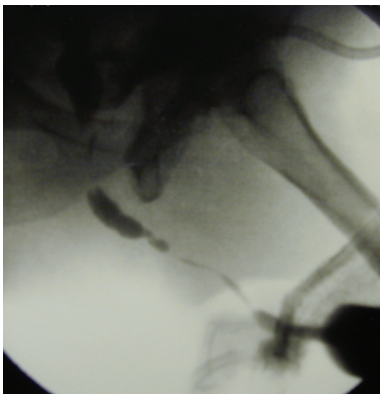
FIGURE 2: Typical retrograde urethrogram appearance of adult stricture after hypospadias repair showing a long stricture sparing only the bulbar urethra.