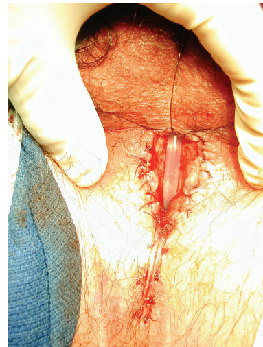
FIGURE 4: Perineal urethrostomy, performed using our suggested "side-to-side" technique.

hypospadias surgeries between 1 and 12 years old. The lag time of the adult urethral stricture presentation ranged from 25 to 57 years, with an average of 36 years between hypospadias surgery and presentation to our clinic with urethral stricture.