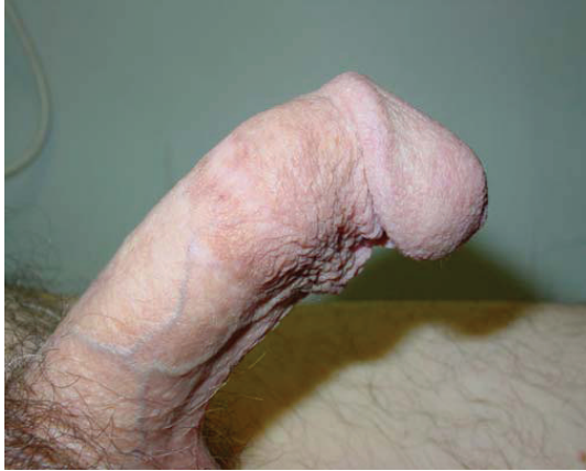
FIGURE 4: A “Concorde” effect due to undersized cylinders.

has to be placed far from the scar tissue, performing a new dilatation. Cavernosa reconstruction can be performed with albugineal surgery, as proposed by Mulcahy [12]. The cylinder can usually be readily reseated in an area of spongy tissue behind the back wall of the sheath containing the extruded cylinder. This is done by making a corporotomy over the cylinder laterally, about half the distance towards the penoscrotal junction, retracting the cylinder to the side, incising the back wall of the cylinder sheath, and dilating a new cavity behind this back wall up to the subglandular area. The cylinder can then be reseated in this new cavity and the back wall of the cylinder sheath will act as the outer covering of the cylinder. A second layer consisting of the outer wall of the cylinder sheath can also be closed to create a more secure barrier against the extrusion of parts. The corporotomy is closed with long-term adsorbable suture. The cylinder is now secured in its proper location by two tough layers comprising the back wall of the original sheath and the corporotomy closure. Cavernosa reconstruction can also be made using synthetic materials like dacron or Gore-Tex.