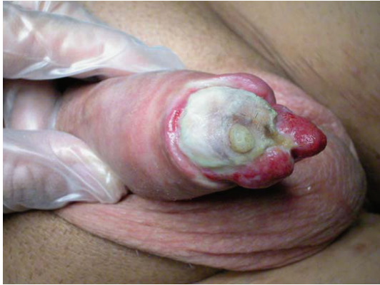
FIGURE 2: Distal erosion with massive glans necrosis.