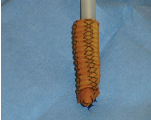
FIGURE 1: A dacron sock created around the tip of a malleable prosthesis in a case of proximal corpus cavernosum perforation.

small hole, the tip can be closed with separate PDS stitches. The way to manage distal perforation in cases of larger holes is by covering the damaged apex with a dacron or gore-tex sleeve.