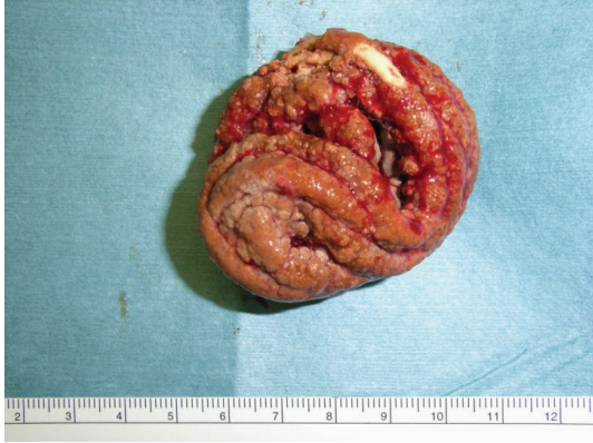
FIGURE 2: The convoluted stone-like foreign body in the bladder.