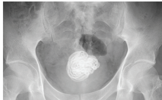
FIGURE 1: Abdominal plain X-ray showing a convoluted foreign body in the bladder.

The patient was a 49-year-old male with no history of any psychiatric disorder. Gross hematuria was noted. He underwent medical examination at the local emergency room and was referred to us for examination of a foreign body in the bladder, which had been identified by ultrasonography. On physical examination, the patient did not report any abdominal pain. A plain X-ray revealed a convoluted foreign body measuring approximately 5 cm in diameter as well as a thickening in the bladder wall (Figure 1). Cystoscopy indicated a stone-like nature of the foreign body. According to the patient, approximately two years ago, he had inserted a vinyl tube into his urethra for masturbation and was unable to retrieve it; it had remained in this position, because of which he experienced urethral pain for the first six months after the incident. Because the foreign body was large, surgery by the transurethral approach was considered difficult. Therefore, suprapubic approach was performed under general anesthesia, and almost the entire foreign body