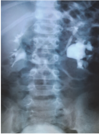
FIGURE 1: The intravenous urography shows the dilated left lower moiety with an abrupt transition to nondilated ureter at the pelvi-ureteric junction consistent with pelviureteric junction obstruction of the lower moiety. The upper moiety is nondilated.