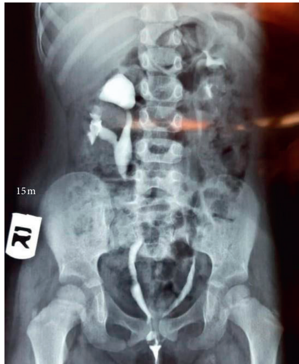
FIGURE 1: IVP with contrast showing agenesis of the bladder and ureters opening to the vagina.