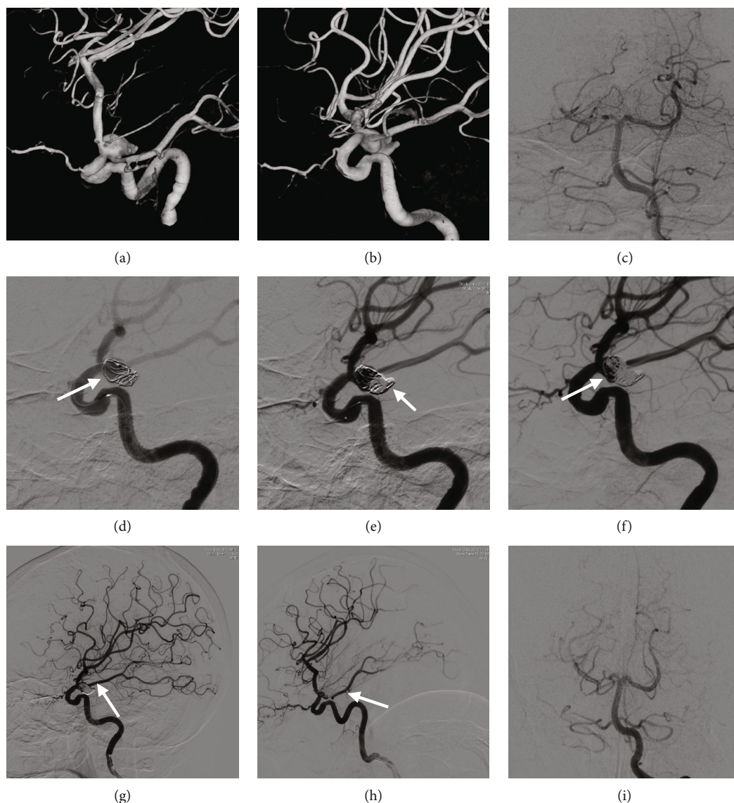
FIGURE 2: Cerebral angiography of the patient 1. (a-c) DSA examination revealed that a right posterior communicating ruptured aneurysm and the embryonic posterior cerebral artery originated from the neck of the aneurysm. (d) The first coil forms a stable support frame, and a few rings entered the posterior communicating artery to provide support (the pillars of the “stilted building”) (arrow). (e) The aneurysm continues to be embolized, and angiography shows that the ruptured sac is densely embolized (arrow). (f) To embolize the aneurysm body, the detaining effect of the frame was leveraged to adjust the position of the coils and avoiding the branch artery (body of the “stilted building”) (arrow). (g) Immediate angiography shows that the ruptured sac and body of the aneurysm are embolized. The lumen of the communicating artery is unobstructed (arrow). (h, i) Seven months after interventional surgery, follow-up DSA shows no recurrence of the aneurysm, and the lumen of the posterior communicating artery is unobstructed (arrow).

of the “stilted building”) and are in no danger of entering into the supported artery. In most cases, the “stilted building” technique requires a combination of dual microcatheter, balloon, or stent assistive technology. When using dual microcatheter technology, one microcatheter is mainly used to form the supporting frame, and the other is mainly used to fill the aneurysm cavity. Balloons or stents are generally used to protect the main trunk or a branch of the parent artery, and an additional branch is protected by the “stilted building” technique.