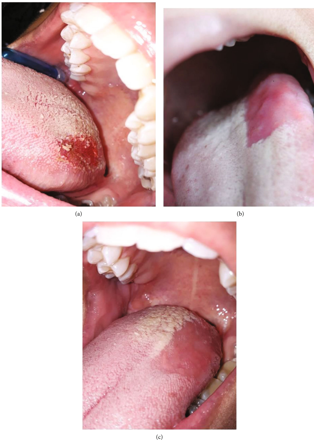
FIGURE 2: Clinical view of the tongue: (a) immediately after removing half of the lesion by the application of a diode laser; (b) one week after surgery; (c) two weeks after surgery.

levels of pain [13]. Laser technology could provide an escape from these complications. In this case, we could use different laser modalities. Due to low penetration depth and high absorption, CO 2 and Erbium family lasers are good options [14], but they are relatively high cost and not easily available