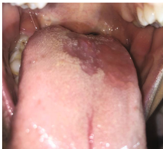
FIGURE 4: Three months after surgical procedure with a diode laser.

versatile wavelength ranges with regard to the number of different treatments it can be used for (soft tissue surgery, periodontal therapy, implantology, endodontics, photobiomodulation therapy, and teeth whitening) [17].