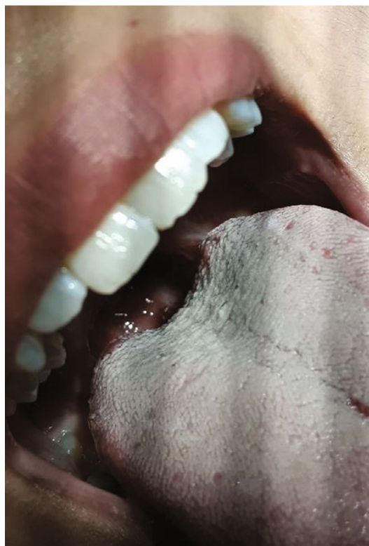
FIGURE 1: Dorsum of the tongue before treatment.

After obtaining informed consent, a surgery was performed under local anesthesia (lidocaine HCL 2% with epinephrine 1:100,000). A diode laser (Twilight, Biolase Technologies, USA) was used by an expert surgeon. The laser enjoyed a wavelength of 810 nm, a power of 4 watts, a pulse width 20 milliseconds, and an interval of 20 milliseconds by a 400-micron optical fiber. The half of the lesion was removed by the laser in a slowly sweeping motion 4 mm above the surface and with a 30-degree angle relative to the tongue (to decrease penetration depth and reduce tissue damage) for 3-4 minutes, accompanied by high vacuum suction removal (Figure 2(a)). Special care was taken to remove only elongated filiform papillae and not to damage fungiform, circumvallate, and foliate papillae. Then, the