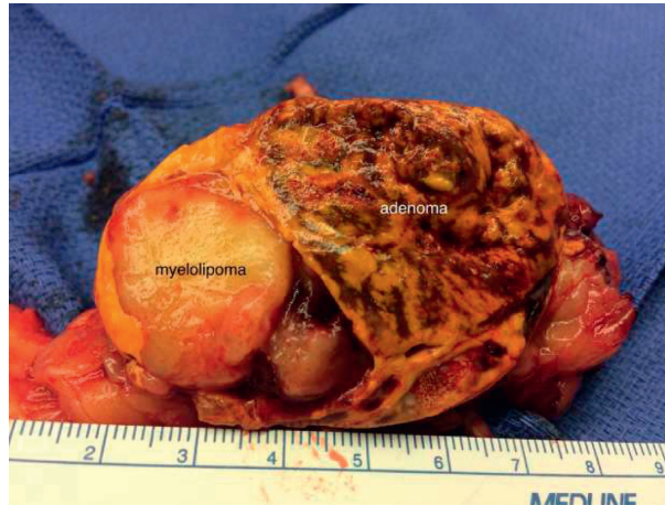
FIGURE 2: The surgical specimen demonstrates the characteristic macroscopic fat component of the myelolipoma with an adjacent well-circumscribed solid golden yellow adenoma.