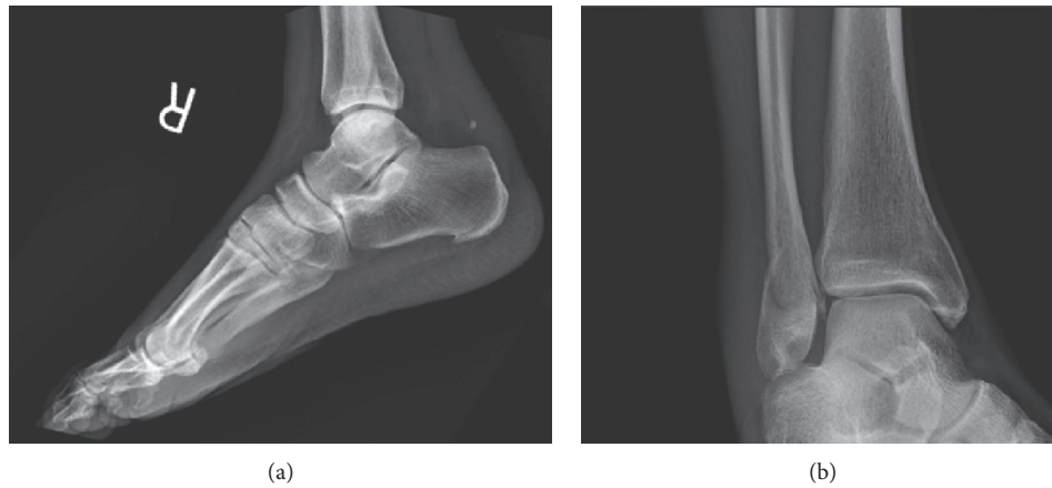
FIGURE 1: Plain radiographs: (a) lateral view and (b) mortise view.