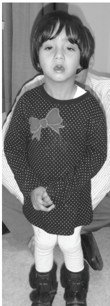
FIGURE 2: Patient at age of 2 years, 11 months. Used with permission.