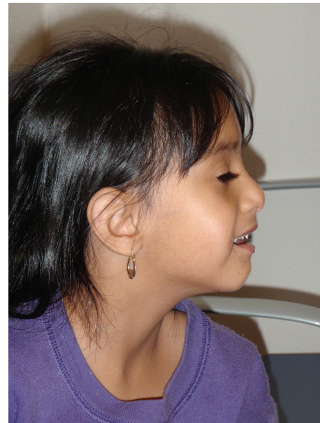
FIGURE 4: Patient at age of 4 years. Used with permission.

Table 1 along with a comparison of the majority of the features associated with Dubowitz syndrome and the 14q32 deletion syndrome. OF the previous 12 patients reported to have 14q32 deletion syndrome, the following craniofacial features are reported: broad philtrum (8 of 8), broad flat nasal bridge (7 of 8), telecanthus (8 of 10), hypotonia (8 of 10), high-arched palate (8 of 10) thin upper lip (4 of 5), blepharophimosis (6 of 8), pointed chin (5 of 9), malformed helices (4 of 7), small mouth (4 of 8), downward slanting palpebral fissures (4 of 8), and strabismus (4 of 9) [8]. Craniofacial features such as facial asymmetry, blepharophimosis,