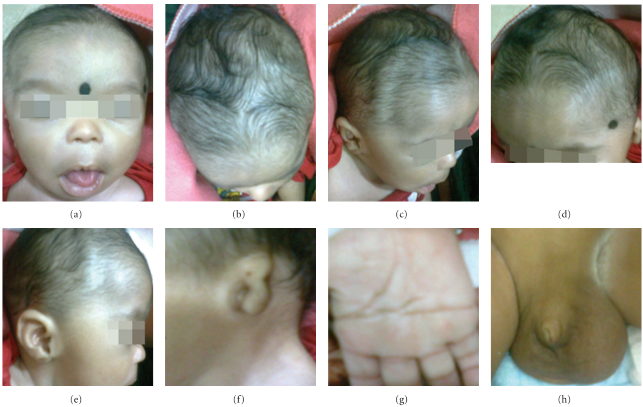
FIGURE 1: (a)–(h) Phenotype of the child at 62 days age.