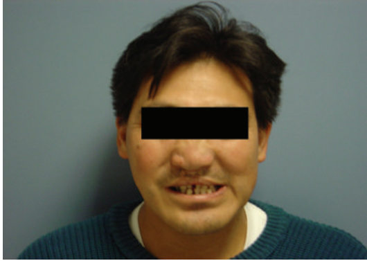
FIGURE 1: Facial patient's profile. Note absence of central incisor, repaired cleft lip and midface hypoplasia.

After obtaining local ethics institutional approval and informed consent, blood samples were drawn from the couple by venipuncture, and genomic DNA was extracted using the GFX Genomic Purification kit (GE HealthCare, Biosciences). The complete SHH coding sequence including the exon intron boundaries was amplified by PCR (primer sequences available upon request). Direct automated sequencing was performed with the Big Dye Terminator Cycle Sequencing kit (Applied Biosystems, Foster City, Calif, USA) in an ABI Prism 310 Genetic Analyzer (Applied Biosystems).