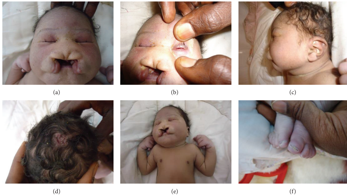
FIGURE 1: Craniofacial abnormalities observed in the patient. Note (a) median cleft lip and palate, (b) anophthalmia, (c) low-set ears, (d) aplasia cutis/scalp defect, (e) postaxial polydactyly on the hands, and (f) preaxial polydactyly of the feet.