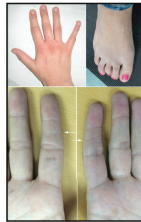
FIGURE 2: Hand and foot views. Note the curled toes and in particular the distinctive bilateral transverse creases involving the middle phalanx of the index finger (white arrows).

2.2. Cytogenetic and Molecular Analyses. DNA of the index patient and her parents was isolated from peripheral blood using the QIAamp DNA Midi Kit (Qiagen, Hidden, Germany) according to the supplier's protocol. Array-CGH (comparative-genomic-hybridization) was carried out using the Cytochip ISCA array (BlueGnome, version 1.0) with 180,000 oligos in a 4 \times 180 k format according to the recommendations of the manufacturer. Briefly, 500 ng of patient and pooled reference gDNA were differentially labeled using the Bioprime DNA Labeling System (Invitrogen, Carlsbad, CA) and the Cy3 and Cy5 fluorescent dyes (GE Healthcare, UK, Ltd.), respectively. Hybridization was carried out using an automated slide processor HS 400 PRO Hybridization Station (Tecan Inc., Männedorf, Switzerland). The array was scanned at 3 \mu m resolution using the Agilent DNA microarray scanner (Agilent Technologies Inc., Santa Clara, CA, USA) and fluorescent ratios were calculated using the BlueFuse Multi software V4.2 (BlueGnome Ltd., Cambridge, UK). Fluorescence in situ hybridization (FISH) analysis was carried out on metaphase preparations using subtelomeric specific probes for the short (p-arm) and long arms (q-arm) of chromosome 10 (Cytocell, Cambridge, UK) according to the recommendations of the manufacturer.