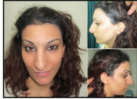
FIGURE 1: Frontal and profile views of our patient.

On the basis of her clinical presentation and facial features, array-CGH analysis was requested. Informed consent was obtained by the patient.