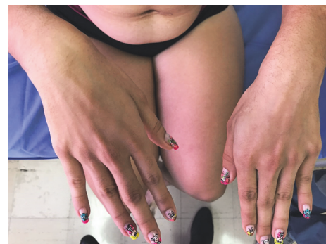
FIGURE 3: Clinical photographs of hands demonstrating prominent interphalangeal joints.