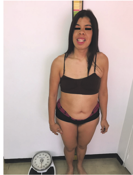
FIGURE 1: Clinical photograph of the patient showing features of overweight and normocephalic head.

Because of progressive coarsening of facial features and moderate intellectual disability due to a brief intelligence quotient of 55, consistent with the diagnosis of moderate intellectual disability, biochemistry enzyme assays were performed and ruled out the diagnoses of Sanfilippo syndrome, Hurler syndrome, and Maroteaux-Lamy syndrome. Urine amino acids, organic acids, and analysis of urinary oligosaccharides and glycosaminoglycans were normal by chromatography. Conventional cytogenetic studies and CGH