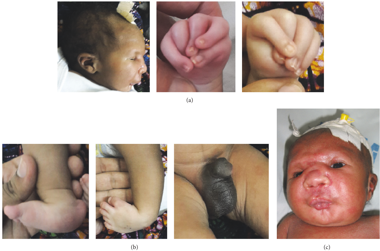
FIGURE 1: (a) from left to right shows micrognathia and low-set crumpled ears, camptodactyly of the right hand, and camptodactyly and “windmill vane position” of the left hand. (b) from left to right shows congenital vertical talus of the right foot (rocker bottom foot), Talipes equinovarus of the left foot (club foot) and chordee. (c) shows the “mask-like” face with a wide and flat nasal bridge, ocular hypertelorism, microstomia, and puckered lips (“whistling face”).

On inspection, an active newborn was seen with a normal level of consciousness and pink in room air. He was hypothermic (33.5°C) and tachypneic (77 bpm) with an appropriate heart rate for the age (147 bpm). As shown in Figure 1, he had multiple craniofacial abnormalities including micrognathia and low-set ears, a wide and flat nasal bridge, ocular hypertelorism, squinted eyes, microstomia, and puckered lips that looked like as if he was whistling. Multiple contractures including camptodactyly of both hands with fingers in the “windmill vane position,” a right congenital vertical talus, and left talipes equinovarus were noted. On genitourinary examination, chordee (downward curved penis) was seen without hypospadias. Initially, expressed breast milk was given through a nasogastric tube. Additional investigations such as brain and cardiac ultrasound were ordered; however they could not be performed due to financial constraints of the mother. Later, the mother was taught how to feed the baby through a container using expressed breast milk and counselled to initiate correction of the talipes equinovarus using the Ponseti method. The child was discharged on day 10 and followed up at the Departments of Physiotherapy and Paediatrics.