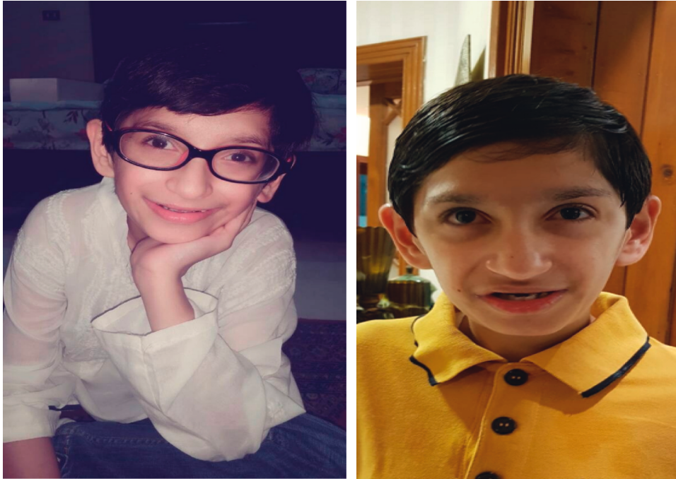
FIGURE 1: Dysmorphic features in the patient, including low set ears, prominent nose, deep-set eyes, and a relatively large mouth, consistent with those reported (MIM#615541) ( https://www.omim.org/clinicalSynopsis/615541 ).