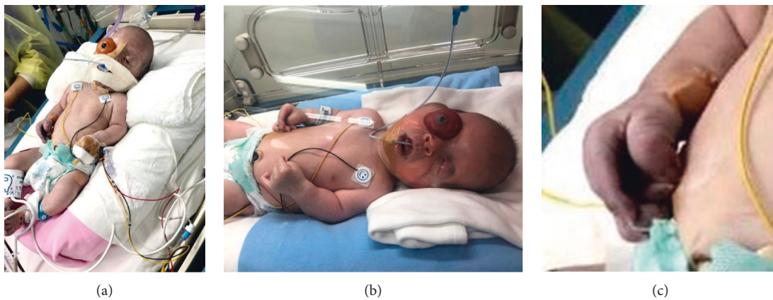
FIGURE 2: (a) Oropharyngeal airway to correct airway obstruction, long bones with proximal rhizomelia, and severe right eye proptosis. (b) Mid-facial hypoplasia, brachycephaly, cloverleaf skull, and bilateral ocular proptosis more severe on the right with absent eyelids (c) Broad thumb with medial deviation of the fingers.

postnatally was a missense mutation reclassified from “likely pathogenic” to Class 1 “pathogenic”.