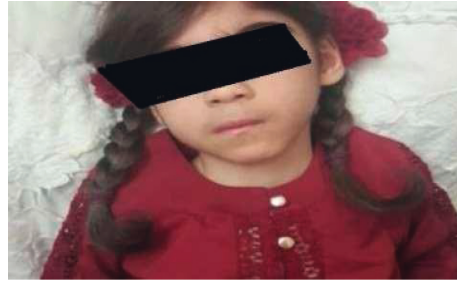
FIGURE 1: A 5-year-old girl with Vici syndrome.