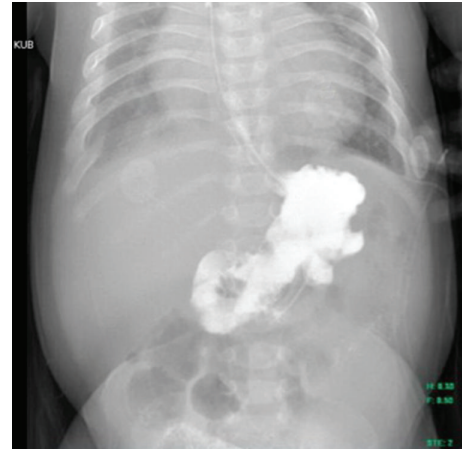
FIGURE 2: Resolution of the ovoid filling defect on a subsequent upper gastrointestinal fluoroscopic series after treatment with N-acetylcysteine.

received 10% NAC at 10 mg/kg/dose diluted in 50 mL of normal saline via nasogastric tube every six hours. The medication was administered over 30 minutes and the nasogastric tube was clamped for two hours. Gastric contents were aspirated three hours after administration of NAC. Our patient required eight doses of NAC to achieve a clear gastric aspirate. Repeat upper gastrointestinal fluoroscopic imaging demonstrated a complete resolution of the GLB (Figure 2). The infant was subsequently restarted on Enfaport 24 kcal/oz with no further issue or recurrence of the GLB.