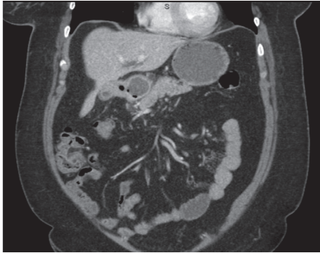
FIGURE 2: Addition CT scan showing a large stone in the duodenum and a cholecystoduodenal fistula.

examine the treatment of a younger individual afflicted by this condition.