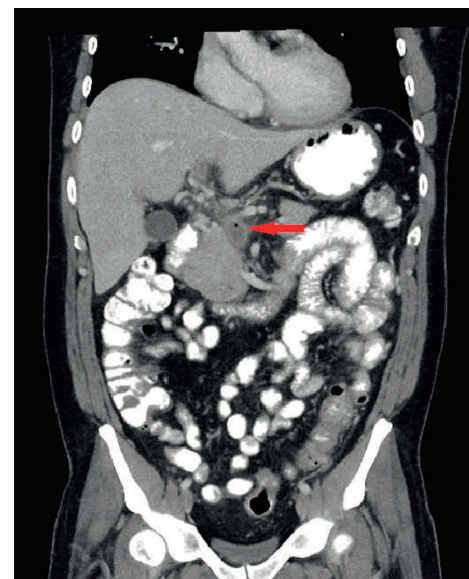
FIGURE 3: Computed tomography (CT) abdomen was repeated which showed resolution of the portal vein gas but showed interval development of portal vein thrombosis and proximal superior mesenteric vein.