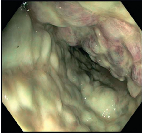
FIGURE 3: Midsigmoid colon showing extension of the severe colitis to the midsigmoid region.

medications and novel therapy. However, to date, we are aware of two other cases of de novo colitis associated with ocrelizumab, with one of them requiring surgical resection [2, 3].