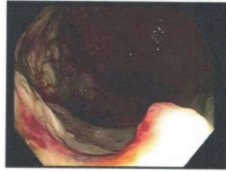
FIGURE 1: Ulcerated gastric antral mass.

Strongyloidiasis is a global infection more commonly seen in Southeast Asia, sub-Saharan Africa, Latin America, Caribbean islands, and Eastern, Southern, and Central Europe [1]. Worldwide, there are 30 to 100 million people infected with Strongyloides stercoralis [2]. In the United States, strongyloidiasis is mostly seen in eastern Kentucky and rural Tennessee. But, sporadically, the infection is seen in immigrants from the endemic area, world war II veterans, and residents of mental institutions [3]. Strongyloides stercoralis is a potentially lethal cosmopolitan nematode or roundworm also known as human threadworm. It has complex stages of life consisting of a free-living cycle, parasitic cycle, and