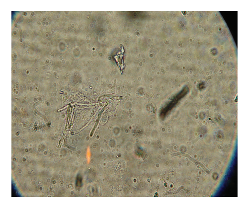
FIGURE 2: 10% KOH mount shows hyaline septate hyphae. (Magnification 40x).

disease, ulcerative lesions of the hard palate, and a nail infection. The isolation of S. commune from cerebrospinal fluid in a patient manifesting signs of atypical meningitis has been reported [10].