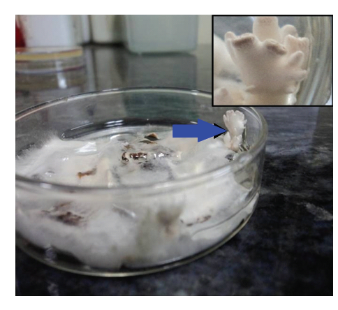
FIGURE 3: Fan-shaped fruiting bodies in banana peel culture (basidiocarps).