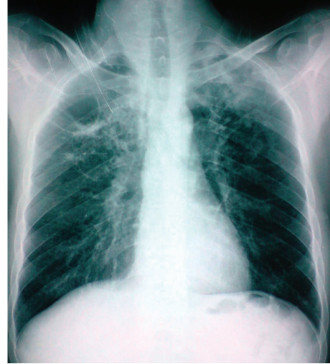
FIGURE 2: Thoracic X-ray revealed bilateral nonhomogenous infiltrations and cavitary lesions in the right lung.

Tuberculosis of the gastrointestinal tract constitutes for 1% of all cases of tuberculosis. It may involve any part of the gastrointestinal system, such as the peritoneum, stomach,