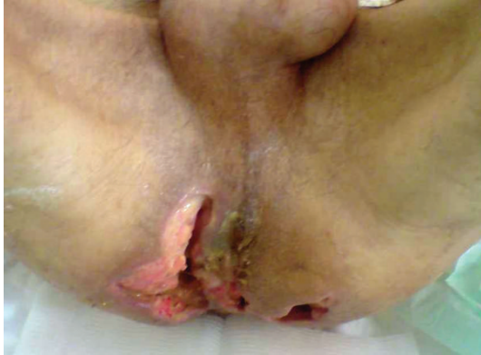
FIGURE 1: Perianal region examination showing large bilateral infected ulcerations followed by pus.

The abdominal X-ray revealed bilateral nonhomogenous infiltrations and cavitary lesions in the right lung (Figure 2). A contrast-enhanced computed tomography scan of the abdominal and pelvic region showed multiple mesenteric and retroperitoneal necrotic adenopathies (Figure 3). The patient was taken to the operating room where a diagnostic laparoscopy was performed and thus showed a thickened and hyperemic peritoneum with Multiple and yellowish white granulations diffusely distributed on the parietal peritoneum and the omentum. Multiple mesenteric adenopathies were noted too. Multiple biopsies of the peritoneum granulations and a diverting sigmoidostomy were performed.