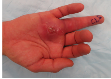
FIGURE 2: Tenosynovitis of the flexor digitorum superficialis (FDS) and flexor digitorum profundus (FDP) tendons. Clear nonpurulent fluid was noted around the tendons. A small puncture area was explored, and no foreign bodies were seen. Tissue samples were sent for pathology and routine and acid fast bacilli (AFB) cultures. Due to the high concern for a potential mycobacterial infection, clarithromycin, moxifloxacin, and rifabutin were started empirically. Three days later, he discontinued these medications due to gastrointestinal side effects from rifabutin without informing his physicians. Exudative cultures were negative; however, AFB cultures were positive, consistent with Mycobacterium marinum .

Surgical exploration of the flexor tendon sheath was performed, during which tenosynovitis was noted of the flexor digitorum superficialis (FDS) and flexor digitorum profundus (FDP) tendons (Figure 2). Clear nonpurulent fluid was noted around the tendons. A small puncture area was explored, and no foreign bodies were seen. Tissue samples were sent for pathology and routine acid fast bacilli (AFB) cultures. Due to the high concern for a potential mycobacterial infection, clarithromycin, moxifloxacin, and rifabutin were started empirically. Three days later, he discontinued these medications due to gastrointestinal side effects from rifabutin without informing his physicians. Exudative cultures were negative; however, early on cultures were positive for AFB, which were later confirmed to be M. marinum . Of note, tissue pathology showed fibroconnective tissue with extensive acute and chronic inflammation and Kinyoun