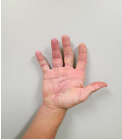
FIGURE 1: Initial presentation of injury. Three weeks after a barb fish spine penetrated the volar aspect of the proximal portion of his ring finger on his right hand. The injury occurred while fishing along one of the Charleston charters in August. He complained of a gradual increase in pain and swelling of the finger. On physical examination, entry and exit points were noted on the affected finger. Marked swelling was present; however, no bruising, cellulitis, discharge, erythema, or induration was noted. He was able to extend and flex the finger.

to the adjacent fingers and lower hand, and an inability to completely flex and extend the affected digits. He denied any fevers, chills, or night sweats. On physical examination, vital signs were normal and he was afebrile. His right upper extremity was grossly normal; however, the volar aspect of the proximal phalanx of the right ring finger had two small scars with a slight firmness of the scar. There was extensive swelling, specifically along the base of the ring finger. There was no palpable foreign body, although there was exquisite tenderness over the A1 pulleys of the right fourth and fifth fingers. He was able to make a full fist without difficulty, and the affected fingertips were neurovascularly intact. No bruising, cellulitis, erythema, or induration of the area was noted, and there was no lymphadenopathy within the right upper extremity.