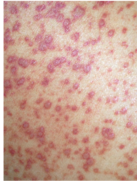
FIGURE 1: Maculopapular cutaneous lesions on the trunk.

Liposomal amphotericin B 3 mg/kg/day was administered [6], while tigecycline was discontinued and sulfamethoxazole-trimethoprim dosage was reduced to 800/160 mg daily. Over the next 3 days, the skin lesions disappeared. A