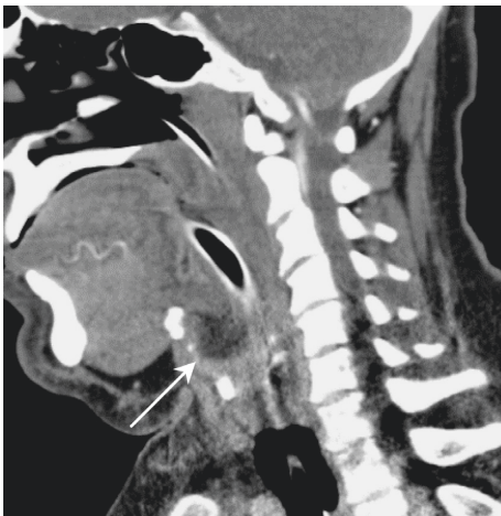
FIGURE 2: Sagittal view of CT neck with contrast demonstrating an extensive parapharyngeal soft tissue swelling and oedema, with an arrow pointing to the epiglottic abscess formation.

inferior border of the left lateral glossoepiglottic fold (Figure 3). A swab was collected and sent for culture and sensitivity. No incision was necessary as the pus had already drained, and residual pus was aspirated using suction.