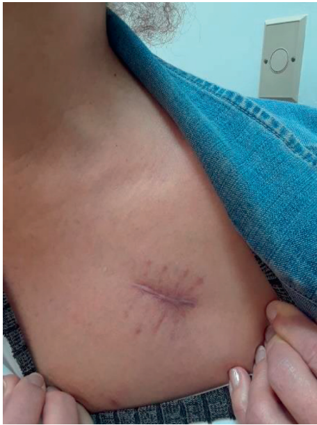
FIGURE 3: Pacemaker pocket site 2 months after the removal of pacemaker and antibiotic therapy.