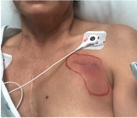
FIGURE 1: Pacemaker pocket site with developing erythema around surgical scar.