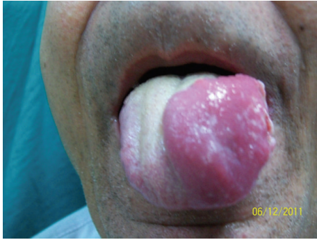
FIGURE 1: Photograph showing hemimacroglossia.