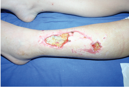
FIGURE 1: Leg ulcer before any treatment.