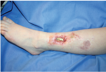
FIGURE 2: Leg ulcer after Ollier-Thiersch dermoepidermal graft.

Antibiotic prophylaxis (cefazolin 2 g 30 minutes before the intervention) is administered.