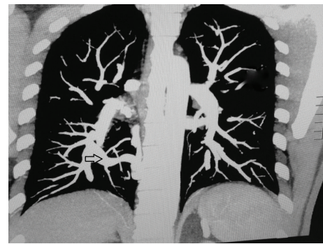
FIGURE 3: Coronal plane CTA showing fistulous connection between anomalous vein and right inferior pulmonary vein.

Scimitar syndrome is classified based on clinical presentation as (a) infantile with significant symptoms and mortality or (b) child/adult with asymptomatic presentation commonly incidentally found in imaging studies. Furthermore, variants of the syndrome have been described. These include the Scimitar vein draining both into the IVC and directly into the left atrium and a variant with a “meandering” pulmonary vein coursing near to but not draining into the IVC [7]. The aforementioned patient presentation would fall under the classification of adult scimitar syndrome with unique variation. The fistulous connection between the anomalous vein and a normal coursing right inferior pulmonary vein provides an uncommon pathway for a paradoxical embolus depending on the direction of flow in the main scimitar vein.