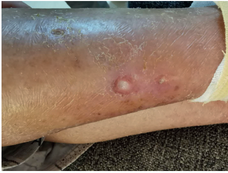
FIGURE 4: Clinical appearance after a week of treatment: the smallest ulcers (upper and right lower) dried and crusted, and the largest one (lower) achieved a significant improvement.