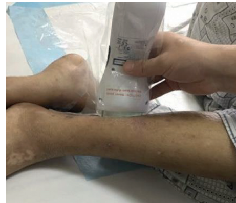
FIGURE 3: At-home application of laser B-Cure on ulcerative lesion: a simple transparent plastic bag was used to wrap the laser and to maintain sterility.

interesting result in terms of healing. Results described for this case report are related to mechanisms of laser PBM as the promotion of physiological effects such as keratinocyte and fibroblast proliferation, maturation and migration, collagen synthesis and deposition, activation of macrophages, and overall in DFU/DLU endothelial cell proliferation, neoangiogenesis and revascularization [6]. The choice of the wavelength of 808 nm was supported by previous reports in the literature describing evidence for the