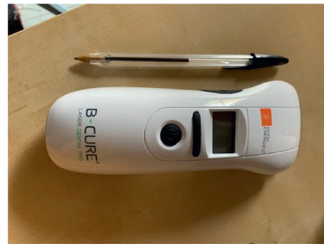
FIGURE 2: The device used for the treatment of the case, B-Cure Laser Pro (Erika Carmel, Haifa, Israel), emitting in the infrared spectrum (808 nm).