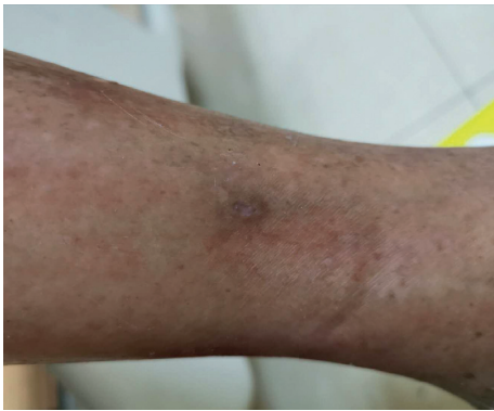
FIGURE 5: Complete healing of all the lesions after 30 days of the laser treatment.

stimulation effects particularly on endothelial cells. Amaroli et al. in 2019 described effects in wound healing repair for treatment performed with an 808 nm laser at a fluence of 60 \text{ J/cm}^2 [14].