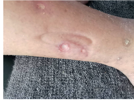
FIGURE 1: First clinical observation of ulcerative lesions on the right leg.

The use of self-administered laser PBM in this case of ulcerative lesions related to diabetes disease gained an