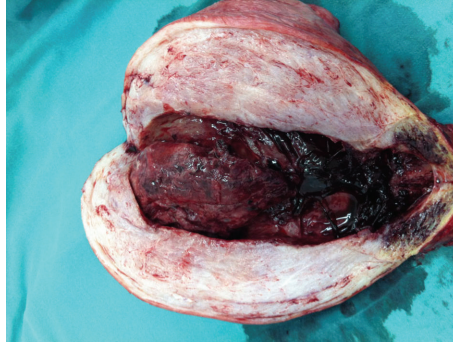
FIGURE 1: Macroscopy of uterus (hysterectomy material).