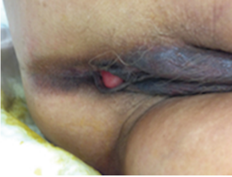
FIGURE 1: Examination demonstrating congenital absence of external anus. The rectovestibular fistula is just visible at the posterior aspect of the introitus near the fourchette.