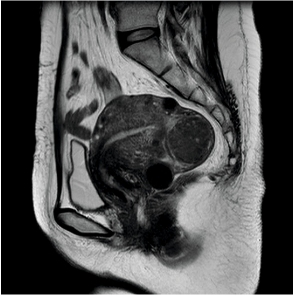
FIGURE 1: Magnetic resonance imaging was performed before uterine artery embolization. MR images show clearly visible fibroids and not tumors.