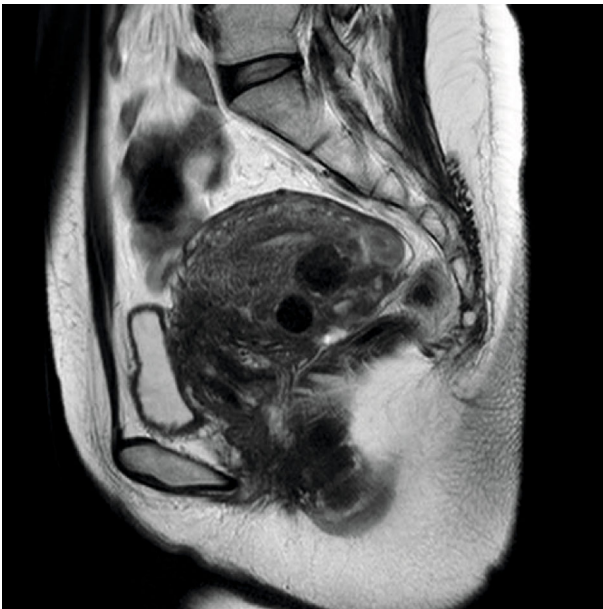
FIGURE 2: Magnetic resonance imaging was performed 2 years after uterine artery embolization. The leiomyomas grew smaller.

had actually sarcoma from the beginning or developed sarcoma during treatment for leiomyomas. Because sarcoma was suspected, she was referred to a higher-order medical institution. She underwent total abdominal hysterectomy with bilateral oophorectomy, pelvic lymphadenectomy, and omentectomy. The uterus measured 14 × 19 cm. There was a pedunculated neonatal head-sized tumor at the uterine bottom and multiple egg-sized leiomyomas in the uterine body.