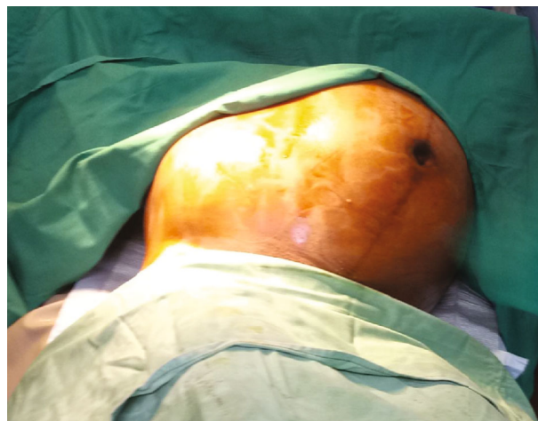
FIGURE 1: Outline of the uterus and the uterine fibroid before surgery.

Elective caesarean section was carried out under spinal anaesthesia at 35 weeks of gestation. Figure 1 shows the outline of the uterus and the uterine fibroid before the commencement of the operation, with the uterus deviated to the right flank and the fibroid located centrally. The abdomen was then opened by a midline subumbilical incision. The huge subserous uterine fibroid was located centrally with the uterus deviated to the right abdominal flank. The outcome was a live female infant of birth weight 2.3 kg and Apgar scores 5 and 8 at 1 and 5 minutes, respectively. Following the delivery of the baby, the uterine incision was repaired. The uterus was then exteriorized, and the relationship of the fibroid to the uterus is as shown in Figure 2. Thereafter, a Foley catheter size 18FG was applied as tourniquet at the level of the internal cervical os; intracapsular myomectomy was successfully performed with careful closure and good homeostasis ensured. The fibroid nodule as seen in Figure 3 showed areas of cystic degeneration and weighed 9.5 kg. It