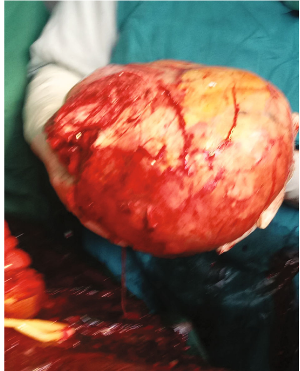
FIGURE 3: Removed fibroid nodule.

Our index patient noticed progressive abdominal swelling over seven years but did not present for treatment in any hospital before she got pregnant. She had responded well to conservative management; thus, antepartum myomectomy was not performed. Despite comprehensive counseling, we had no way of ensuring that the patient would return for myomectomy after the delivery of the baby. Also, the lady was primiparous; thus, she would likely have returned with more complications due to uterine fibroids in subsequent pregnancies. Caesarean myomectomy was further adjudged to be safe in this case because the ultrasound scan showed a single, large, subserous fibroid nodule. Based upon the above considerations, an intracapsular caesarean myomectomy was successfully performed after delivery of the baby. This is the currently recommended technique for caesarean myomectomy [27, 28] which is safe, feasible, and reliable if correctly performed in carefully selected patients [27–29]. Intracapsular myomectomy technique is currently recommended because the fibroid pseudocapsule (which is preserved during the procedure) has been shown to contain many neuropeptides and neurotransmitters. These substances play a positive role in wound healing and improvement in subsequent sexual and reproductive functions [30].