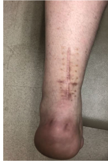
FIGURE 5: Six months postoperative visit from revision surgery.

Rerupture after Achilles repair is reported at about 2-12%, with no statistical difference reported between open, percutaneous, augmented, or closed treatment methods [1-4, 7, 9, 16]. Open rerupture is an exceedingly rare complication and has only been described a handful of times [17-19]. This