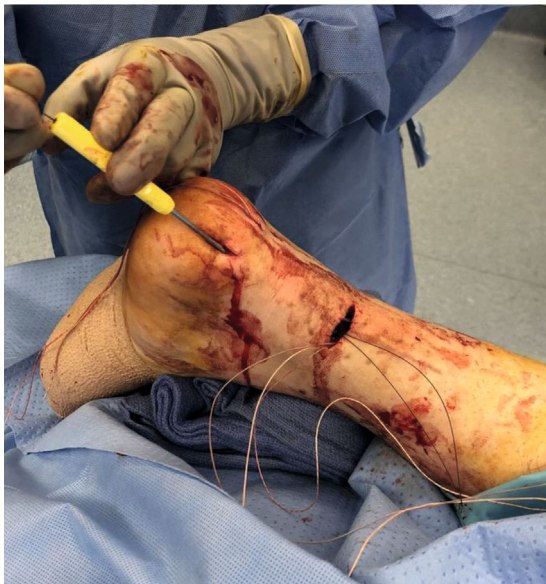
FIGURE 4: Sutures being passed from proximal Achilles through distal tendon stump with suture lasso to be anchored in the calcaneus.

At most recent follow-up, six months after revision surgery, the patient's skin is well healed, and he walks without a limp and has begun jogging again (Figure 5).