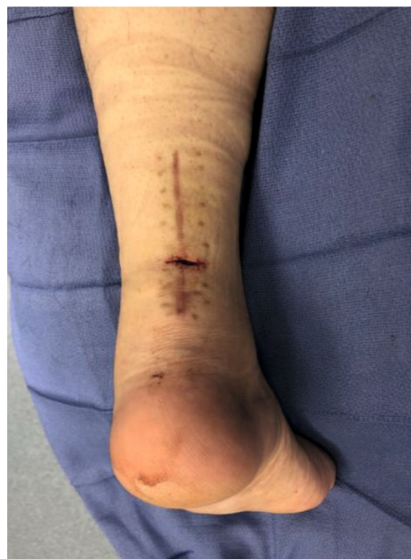
FIGURE 2: Intraoperative photograph of open rerupture of the achilles tendon. Axis of the wound is transverse and perpendicular to the original surgical incision.

By postoperative week 12, the patient’s skin had completely healed, and he was ambulating without his pneu-