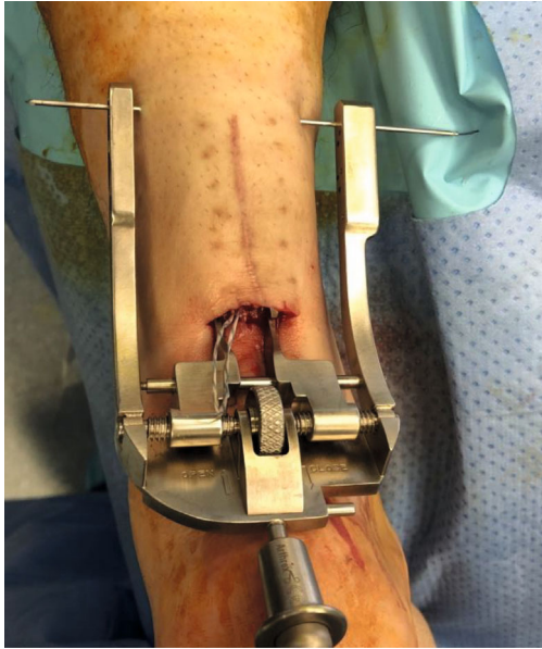
FIGURE 3: Revision surgical intervention utilizing minimally invasive jig to pass sutures through the proximal Achilles stump.