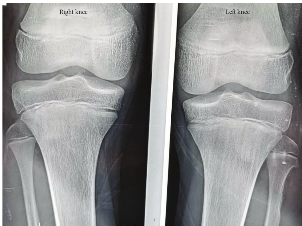
FIGURE 4: Plain X-rays of both knees directly postoperatively.