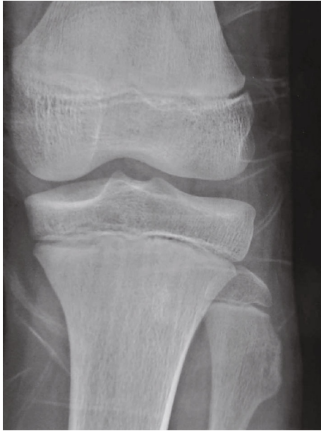
FIGURE 1: Anteroposterior plain films of the left knee showing an osteophytic protuberance in the neck of the fibula.

The rest of the examination did not reveal frontal and sagittal laxity of the knee, nor other abnormalities regarding the musculoskeletal and neurological system.