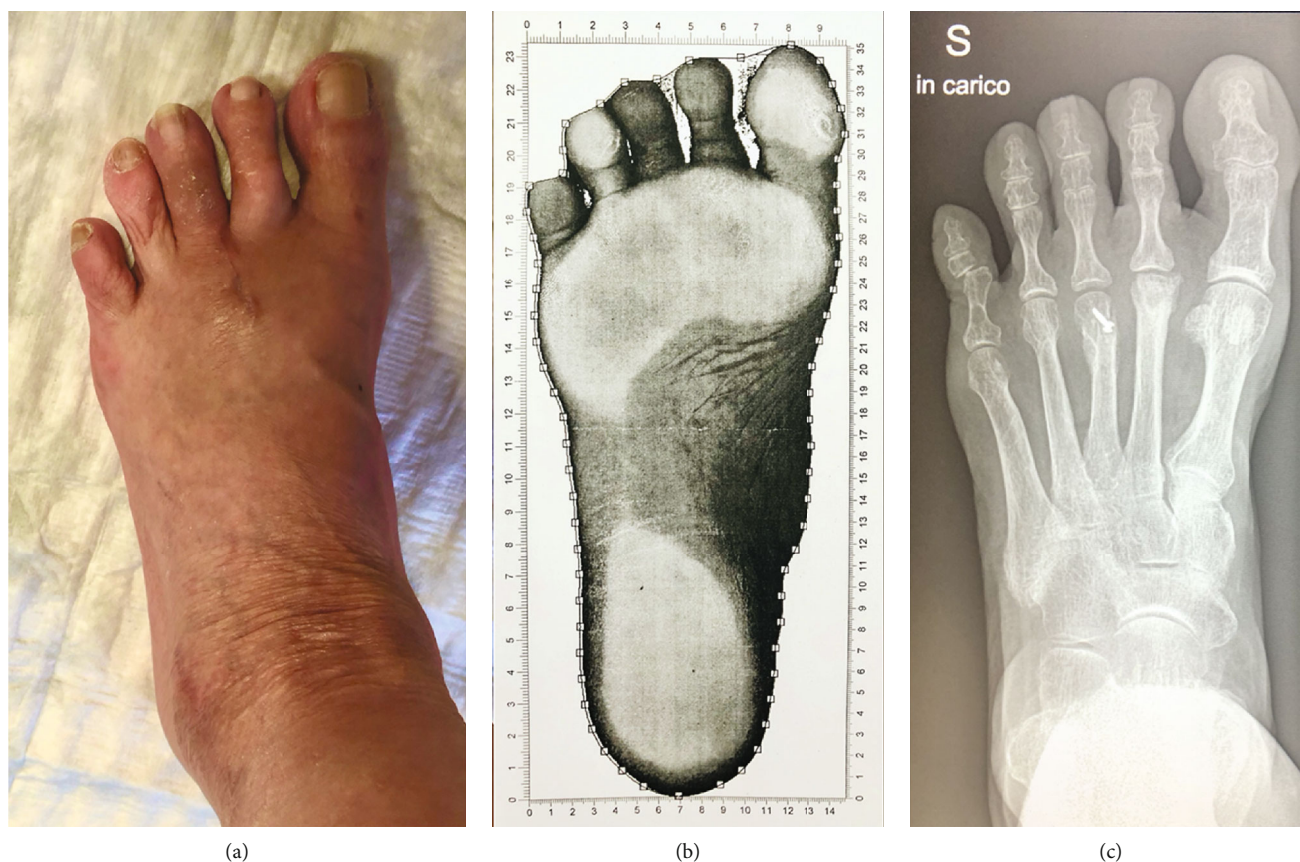
FIGURE 5: Results at the 3-month follow-up after removing the K-wire, with (a) photograph while weight bearing, (b) walking analysis, and (c) plane X-ray.