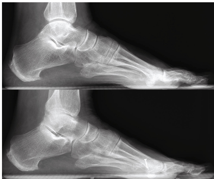
FIGURE 2: Lateral radiograph prior surgery and at three months follow-up.

and rigid plantar soles failed. X-ray in the ap view showed the deformity weight bared (Figure 1(c)). Figure 2(a) showed the deformity in the lateral view.