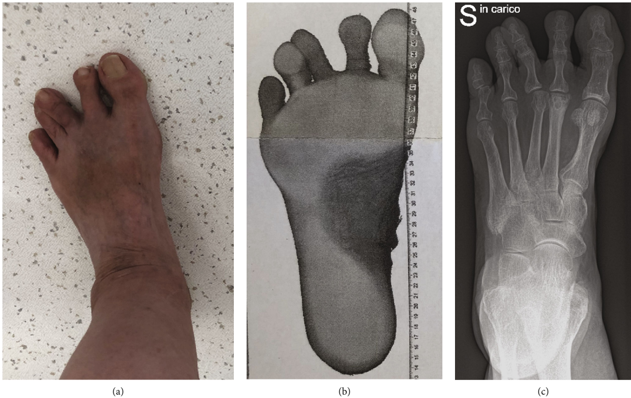
FIGURE 1: (a) Splay toe between 2 nd and 3 rd toe. (b) Dynamic analysis of the foot while weight bearing. (c) Plane X-ray of the foot showing Smillie stage V necrosis of the 2 nd metatarsal head causing the splay toe deformity with a relatively long 3 rd metatarsus.