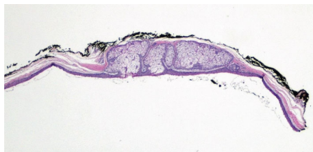
FIGURE 3: Sebaceous glands contiguous with the cyst wall. Hematoxylin-eosin, original magnification \times 40 .

To confirm this interpretation (particularly due to the unusual location of the tumor), a standard immunohistochemistry panel was used. Indeed, extracranial meningioma was confirmed (see Figures 2(c)–2(e)).