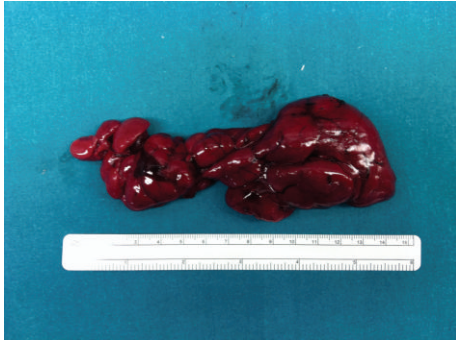
FIGURE 1: Adult rhabdomyoma (the large tumor was red lobulated mass).

glycogen, while immunohistochemical studies demonstrate the presence of myoglobin, desmin, actin, and vimentin. Tumour cells do not express cell proliferation markers such as Ki-67 and PCNA, indicating that the lesions are more likely hamartomas than neoplasms. They may spontaneously regress, but severe symptoms may precipitate the need for surgical excision. Antiarrhythmic drugs can be helpful if arrhythmias are the presenting symptom [3].