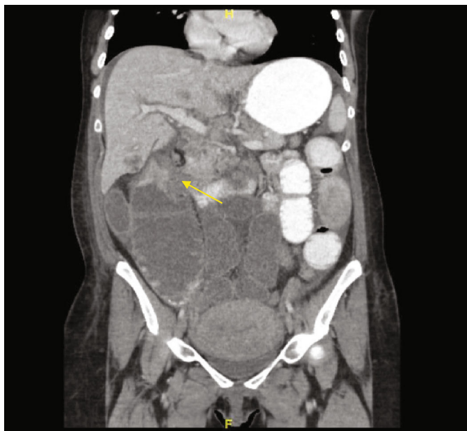
FIGURE 1: Computed tomography scan showing a mass in hepatic flexure of the colon.

both preeclampsia and elevated liver enzymes, during the third trimester of her pregnancy.