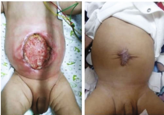
FIGURE 4: Granulation tissue formation and cosmetic closure of the defect.

the bedside, thus lowering the financial burden on both hospitals and families [6, 7]. Therefore, it gained a wide acceptance in developed countries and across nations [4, 9–11]. The umbilical cord closure type of SSA without endotracheal intubation and general anesthesia is found to be more successful in smaller, more premature neonates [18]. A study