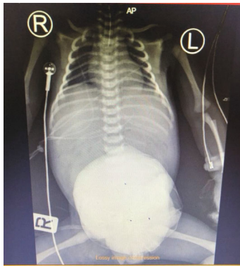
FIGURE 3: X-ray of the silo bag inside the neonate.