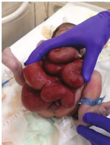
FIGURE 1: Patient's condition at the delivery.