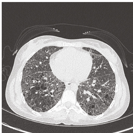
FIGURE 1: Chest computed tomography of the patient's native lungs demonstrating cystic changes, diffuse coarse reticular interstitial thickening with associated ground glass opacities.