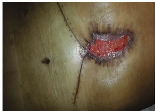
FIGURE 3: Follow-up at the time of discharge after 2 months.

The cutaneous mucormycosis typically is a rare condition; however, it has a good survival rate when diagnosed early [3, 4]. Although definite prevalence of skin mucormycosis is unknown, according to the review of previous studies, it is estimated that this disease has a prevalence of 0.43 to 1.7 per million [7]. Inhalation or inoculation of spores of Mucorales on the skin or mucous is the common transmitted pathway in humans [8]. Past reports suggested that the most frequently isolated strains of cutaneous mucormycosis are