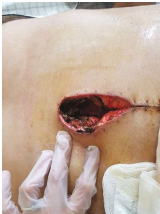
FIGURE 1: Wound appearance at the initial phase of disease (necrotic edge is seen).

Our center follows a local protocol for prophylaxis: targeted antifungal prophylaxis, preemptive therapy for Cytomegalovirus (CMV) except for high-risk patients including patients with acute liver failure, donor positive-recipient negative serology, and retransplantation that receive primary prophylaxis. We also use universal prophylaxis for Herpes virus (HSV) with acyclovir for the first 4 weeks after transplant and Pneumocystis pneumonia (PCP) with pyrimethamine-sulfadiazine for 6 months. In targeted antifungal prophylaxis, we assess the patients based on their risk factors; the high-risk patients include patients with retransplantation, reoperation within first month, and acute liver failure and those who need renal replacement therapy receive voriconazole for 4 weeks.