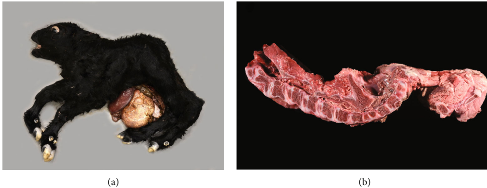
FIGURE 1: Gross necropsy photos of the stillborn male Angus calf with appreciable congenital deformities: short and rounded skull, maxillary brachygnathism, arthrogryposis, vertebral aplasia, and abdominal organ herniation (a). A longitudinal section of the spine in right lateral orientation (b) highlights agenesis of the lumbosacral and caudal vertebra and spinal cord agenesis abnormalities as are characteristic of perosomus elumbis.

and transrectal palpation examinations (especially positioning of the broad ligaments, uterus, and fetus), the cow was diagnosed with an approximately 360° left (counterclockwise from the rear of the animal) uterine torsion.