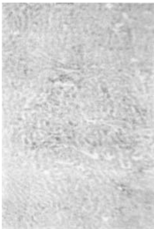
Fig. 1. Histological examination of a liver section from control animal shows normal liver.

by which PFOA induce catalase activity most probably by increase in enzyme synthesis rather than degradation. Reddy et al. [29] have shown that treatment of rats with a single dose of ciprofibrate (a peroxisome proliferator) provoked 1.4-fold increase in catalases mRNA estimated 1 and 16 h. post-treatment.