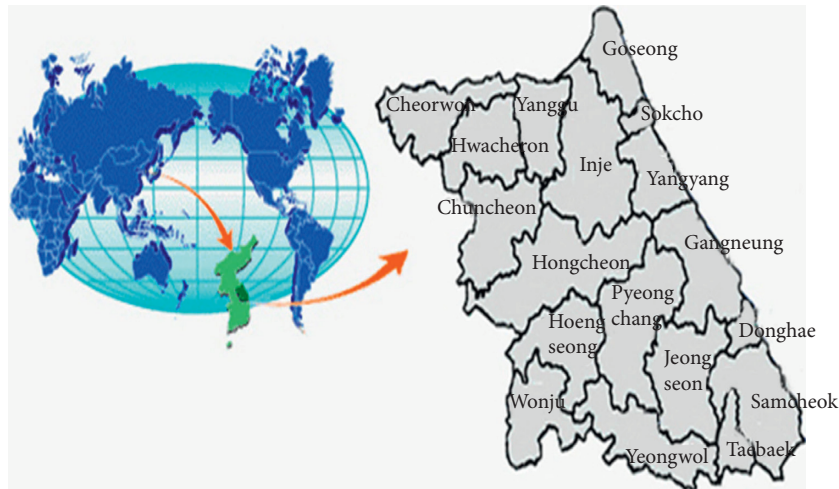
FIGURE 1: Map of Gangwon Province (accessed at http://www.provin.gangwon.kr/gw/portal ).

variables and the outcome are summarized using proportions for categorical variables and means and medians for continuous measures. Statistical comparisons of observed values between outcome groups were based on weighted \chi^2 and t -tests adjusted for survey characteristics. If a continuous parameter was normally distributed, we applied the t -test for independent samples. For nonnormally distributed data, we used the Mann–Whitney U test. Pearson's \chi^2 test or Fisher's exact test was used to compare categorical variables. Standardized plausibility checks were carried out under statistical supervision. For statistical analyses of the data, we used IBM SPSS version 20.